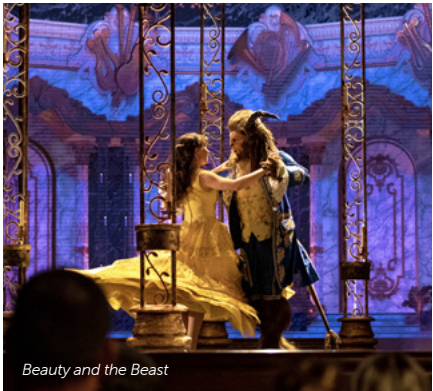
Beauty and the Beast