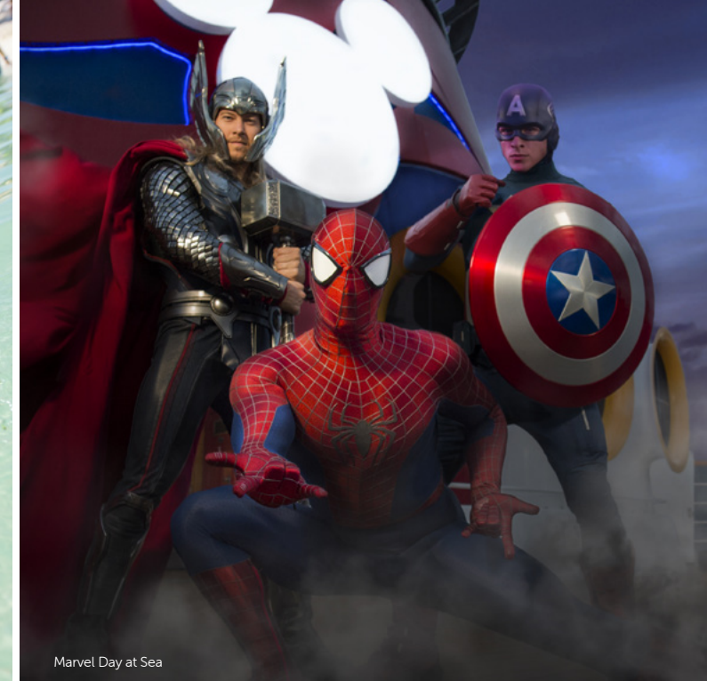
Marvel Day at Sea