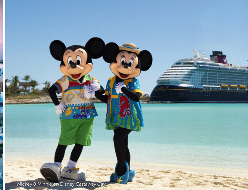
Mickey & Minnie on Disney Castaway Cay