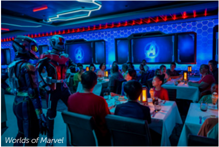
Worlds of Marvel

Enjoy dinner with your little ones, then let Disney Youth Co-ordinators collect them for an evening of fun and games, so you can savour the evening at your own pace.