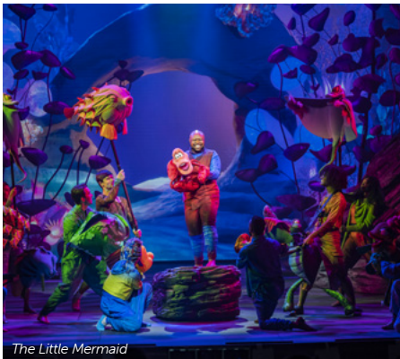
The Little Mermaid

The newest ship to join the Disney Cruise Line family is now sailing. Be among the first to experience the all-new enchantment on board, where fantastical worlds and beloved stories from Disney, Marvel, Star Wars and Pixar are brought to life like never before.