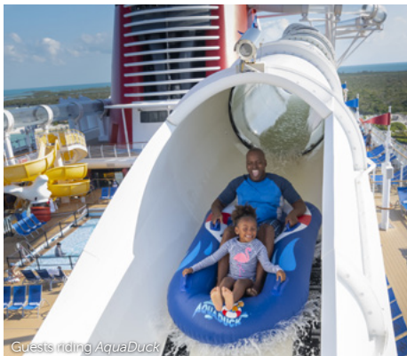
Guests riding AquaDuck