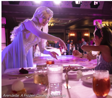
Arendelle: A Frozen Dining Adventure