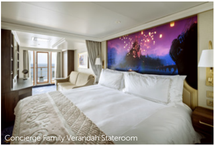
Concierge Family Verandah Stateroom

Disney Cruise Line staterooms are among the first in the industry to be tailored especially for families, pioneering innovative comforts and modern features you won't find with any other cruise line. With accommodation ranging from cosy private lodgings to grand and richly appointed suites, from spacious rooms to sweeping views, there's a stateroom to fit your needs for fun and comfort.