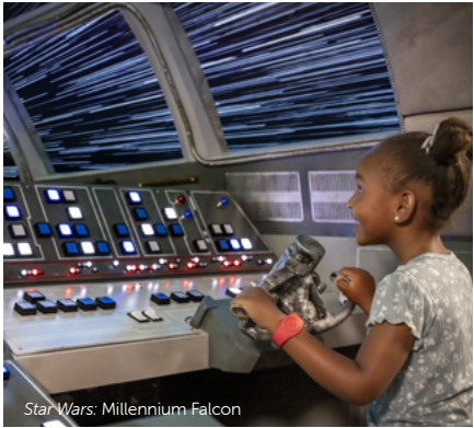
Star Wars: Millennium Falcon