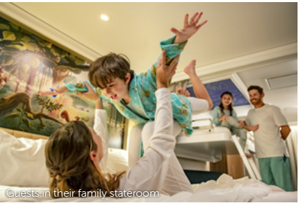
Guests in their family stateroom