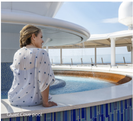
Quiet Cove pool