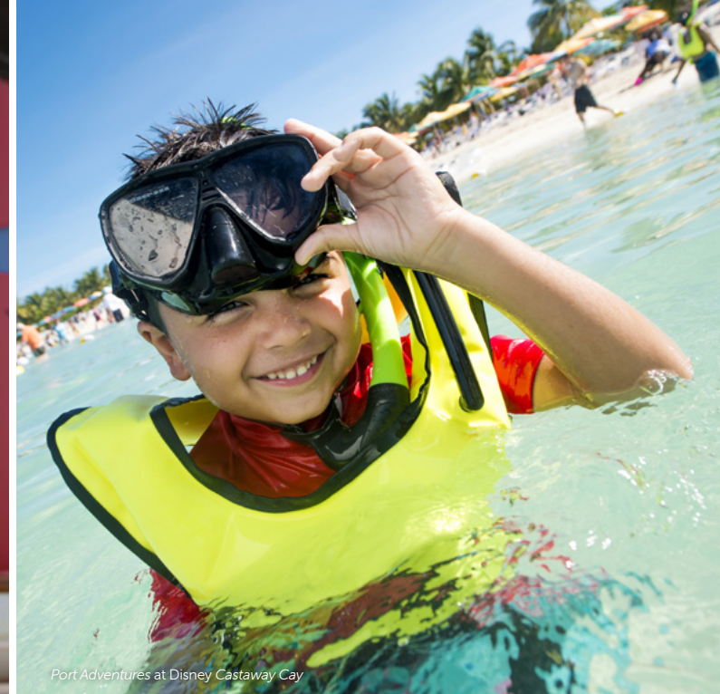
Port Adventures at Disney Castaway Cay