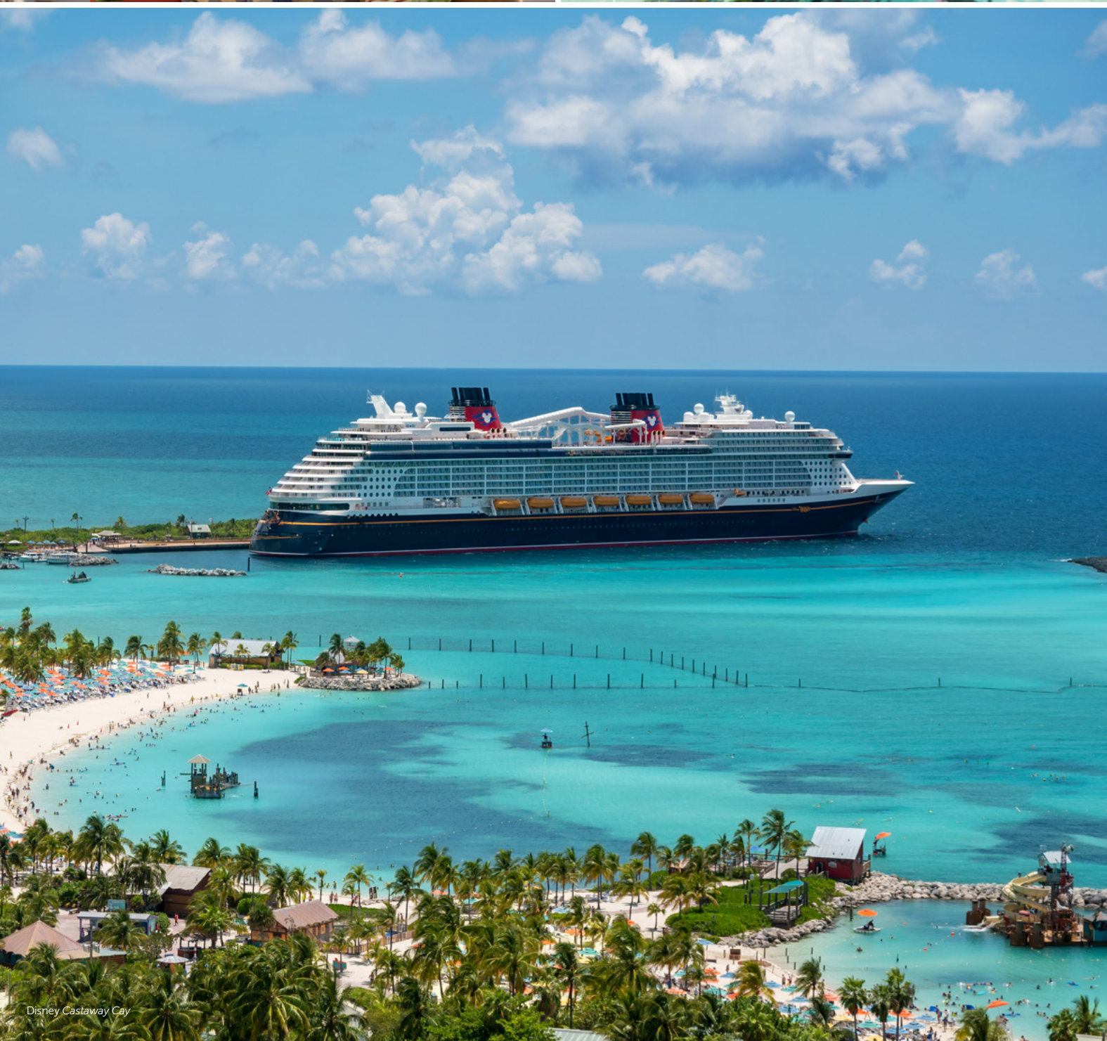
Disney Castaway Cay