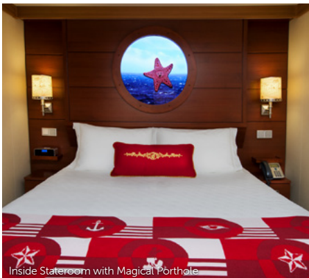
Inside Stateroom with Magical Porthole

Experience the Disney Dream as it sails for the first time in Europe. Combining classic beauty and modern luxury with legendary Disney storytelling, the award-winning Disney Dream invites you to embark on an unforgettable voyage where dreams really do come true.