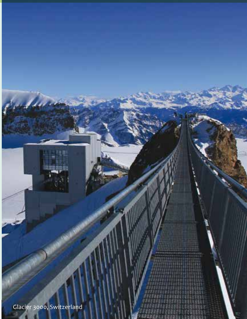
Glacier 3000, Switzerland

check into the hotel. Overnight in Paris. (B, D)