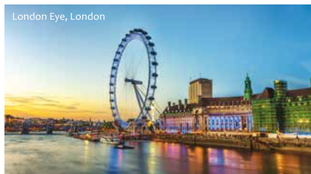
London Eye, London

Today we go to Calais, France by the Eurotunnel train from Folkestone or by ferry from Dover. We then proceed to Paris and