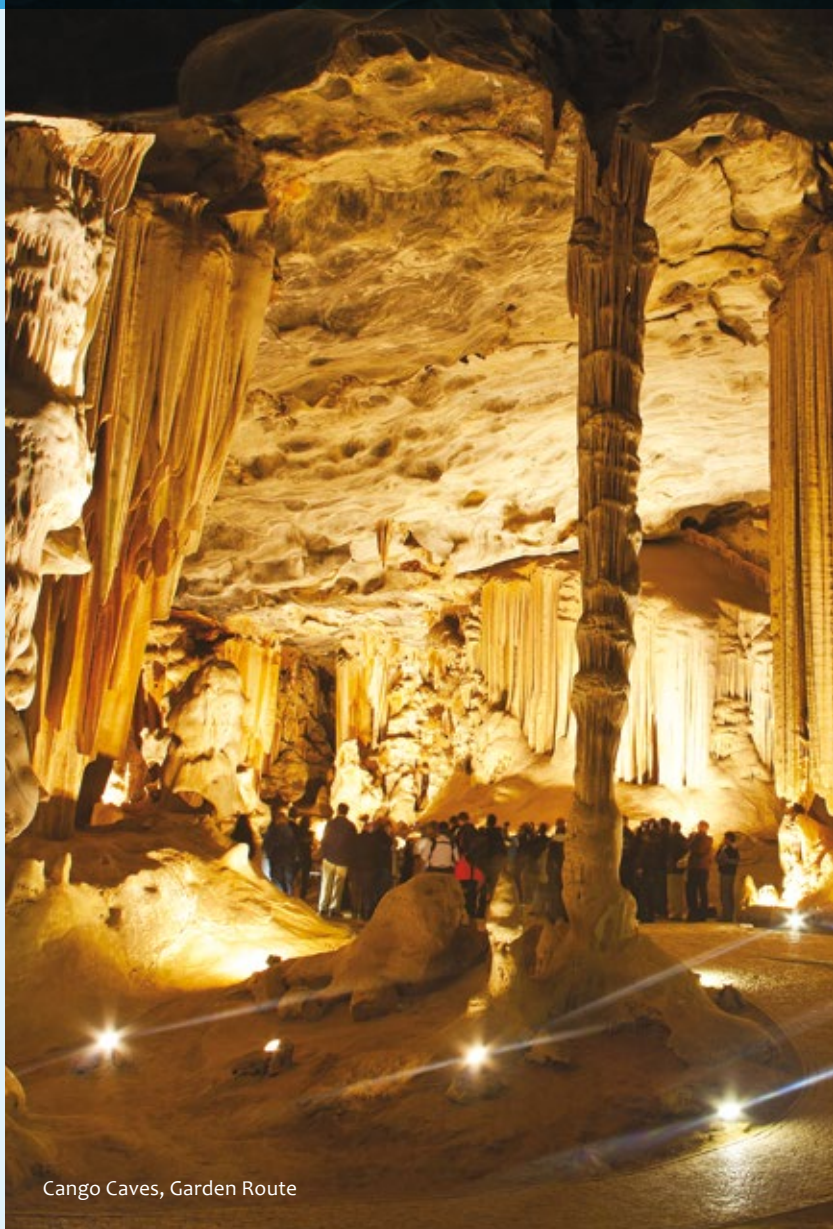
Cango Caves, Garden Route