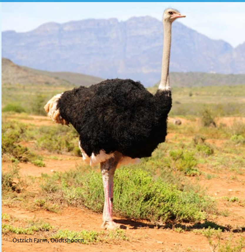
Ostrich Farm, Oudtshoorn

Today, after breakfast head for a panoramic tour of Johannesburg before you drive to the Johannesburg airport to board your flight to Port Elizabeth. Upon arrival, drive to the Garden Route, a scenic stretch of the south-eastern coast of South Africa, stretching from Mossel Bay in the Western Cape to the Storms River. En-route, stop at The Bloukrans Bridge in Tsitsikamma National Park where you have a chance to bungee jump off one of the highest bungee-jump bridges in the world (On your own). Overnight on the Garden Route. (B, HPL, D)