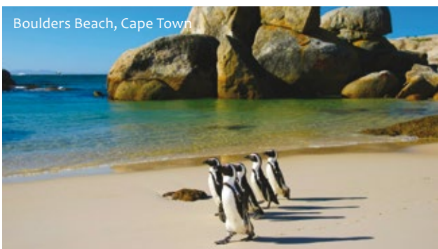
Boulders Beach, Cape Town

Today early morning after breakfast, proceed to the airport to take your flight to Johannesburg and proceed to Sun City. Explore the vast complex of Sun City on your own. You will be amazed at this oasis in the desert, with a man-made sea, complete with waves and beaches. Enjoy wind surfing or go swimming at the Valley of the Waves or relax at the Water World.