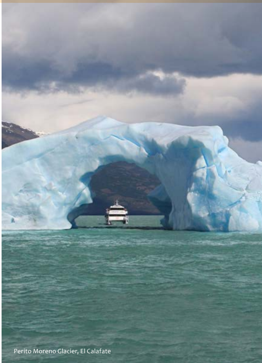
Perito Moreno Glacier, El Calafate