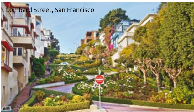
Lombard Street, San Francisco