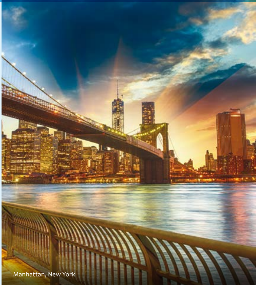
Manhattan, New York

Today, we take you to EPCOT to celebrate fascinating cultures and numerous wonders of the world around you, through dazzling shows, interactive experiences and amazing attractions. Step