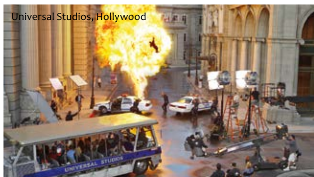
Universal Studios, Hollywood

Today, visit the famous Universal Studios, a film studio and theme park in the San Fernando Valley area of Los Angeles, where some of Hollywood’s biggest hits are made. On a tour of Los Angeles drive through Sunset Boulevard, Beverly Hills and many more famous places. Overnight in Los Angeles. (B, D)