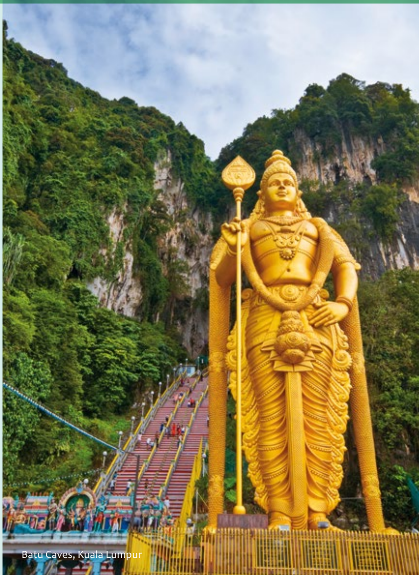
Batu Caves, Kuala Lumpur